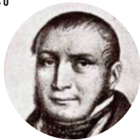
LA BOURDONNAIS 1795-1840