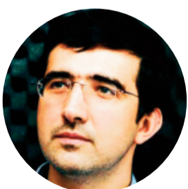
VLADIMIR KRAMNIK 1975