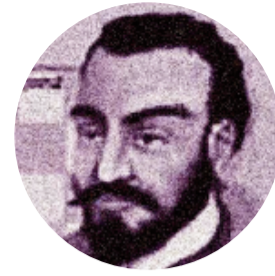
RUY LÓPEZ DE SEGURA 1530-1580