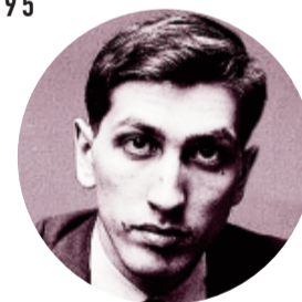
BOBBY FISCHER 1943-2008