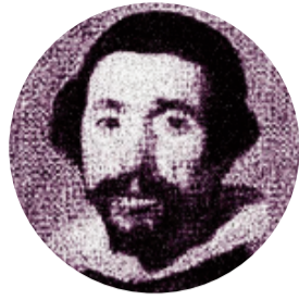
LUIS RAMÍREZ DE LUCENA 1465-1530