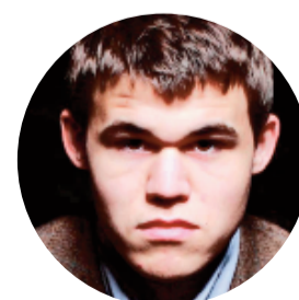
MAGNUS CARLSEN 1990