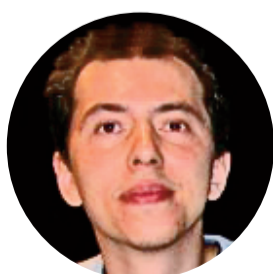
RUSTAM KASIMDZHANOV 1979