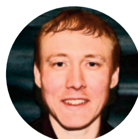
RUSLAN PONOMARIOV 1983