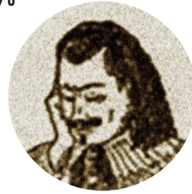
GIOACHINO GRECO 1600-1634