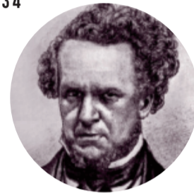
HOWARD STAUNTON 1810-1874