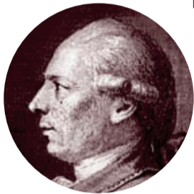
ANDRÉ DANICAN PHILIDOR 1726-1795