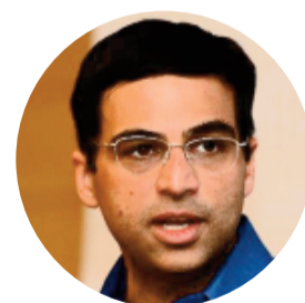
VISWANATHAN ANAND 1969