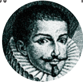
ALESSANDRO SALVIO 1570-1640