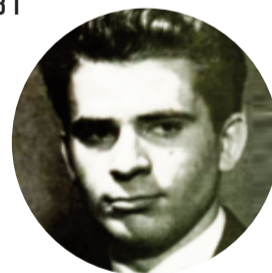
BORIS SPASSKY 1937