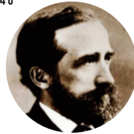
JOHANNES ZUKERTORT 1842-1888