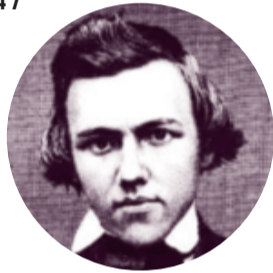
PAUL MORPHY 1837-1884