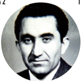
TIGRAN PETROSIAN 1929-1984