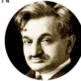
EMANUEL LASKER 1868-1941