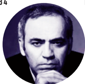
GARRY KASPAROV 1963