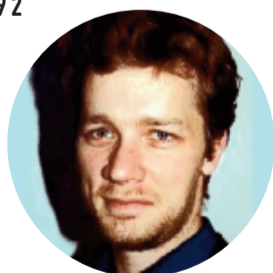
ALEXANDER KHALIFMAN 1966